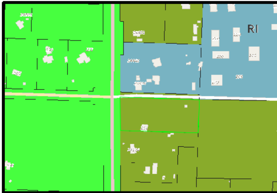
18-00331 (A-CUP) Bushel & Barrel Ciderhouse Tasting Room