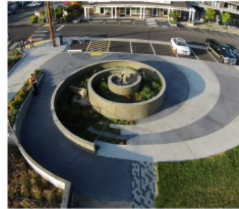
Stormwater Management Manual for Western Washington

https://fortress.wa.gov/ecy/ezshare/wq/Permits/Flare/2019SWMMWW/Content/Resources/DocumentsForDownload/2019SWMMWW.pdf