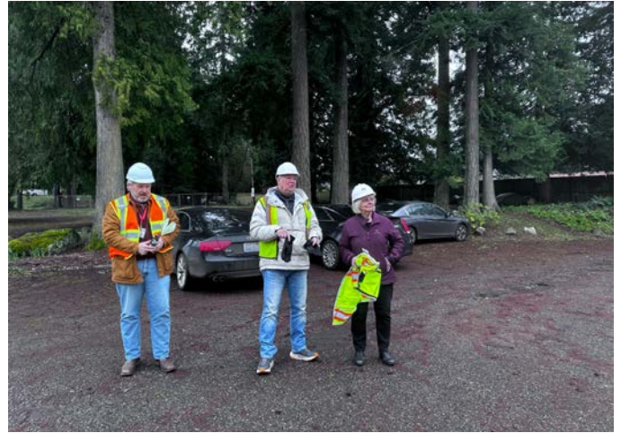
Kitsap County Project Executive Team Site Review