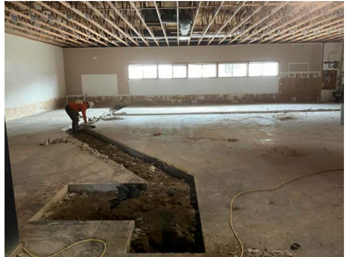
Future co-shelter living area