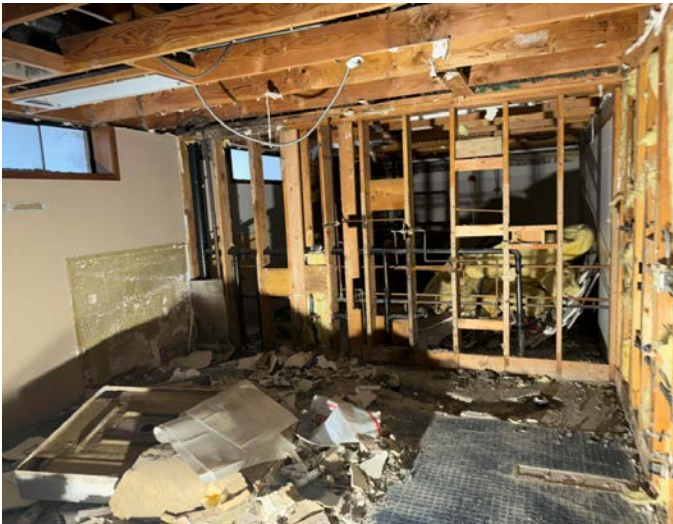
Future Shower Facilities