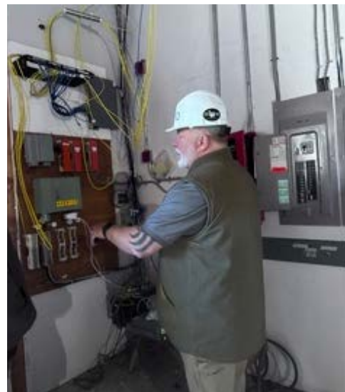
Kitsap IT / IS System upgrades