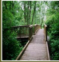
Clear Creek Trail