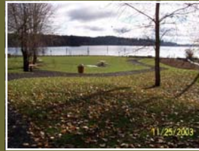
Old Mill Park