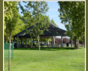
Silverdale Waterfront Park