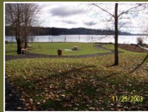
Old Mill Park