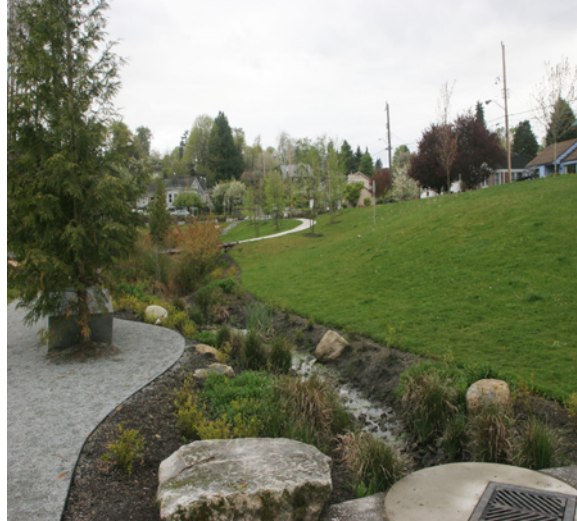
Detention Pond Park, Seattle