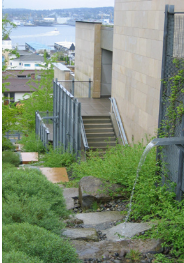
Stormwater Cascade, Port Orchard

Kitsap County is studying options for improving Manchester’s stormwater infrastructure. The Study will identify potential projects. Options for improvements include conventional “grey” infrastructure and “green” infrastructure.