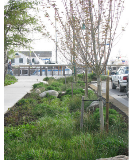
Roadside Rain Garden, Port Townsend