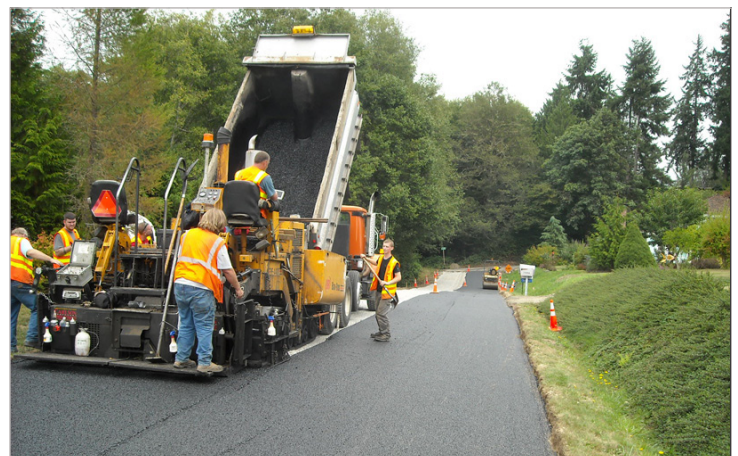
Porous asphalt in Kitsap County

Kitsap County Public Works built porous asphalt projects in North, Central and South Kitsap in Fall 2010.