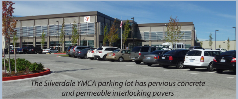
The Silverdale YMCA parking lot has pervious concrete and permeable interlocking pavers