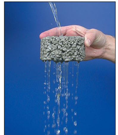
Pervious concrete allows water to flow through it

Permeable pavement has been used throughout the United States since the mid-1970s. Because it is a best management practice and a low impact development technique, cities, counties, and developers in the Puget Sound area increasingly use permeable pavement to manage stormwater. Permeable pavement systems not only reduce stormwater runoff, but also enhance water quality.