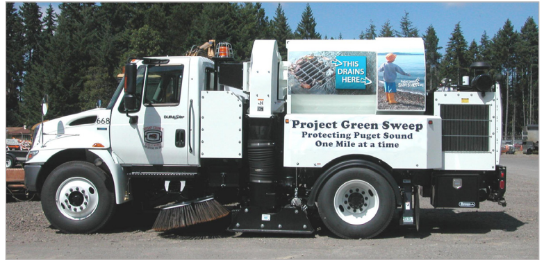
Kitsap County's new high-efficiency street sweepers will maintain the County's porous asphalt roads

People can help keep permeable pavement working well by not allowing sand or other fine material on it. For example, if you have soil delivered for landscaping, do not place the soil directly on the pavement. Instead, lay down a waterproof tarp first. Also, prevent silty runoff from flowing onto permeable pavement.