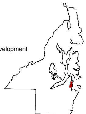
Figure 16-1 Manchester Comprehensive Plan Map