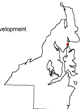
Figure 16-2 Suquamish Comprehensive Plan Map