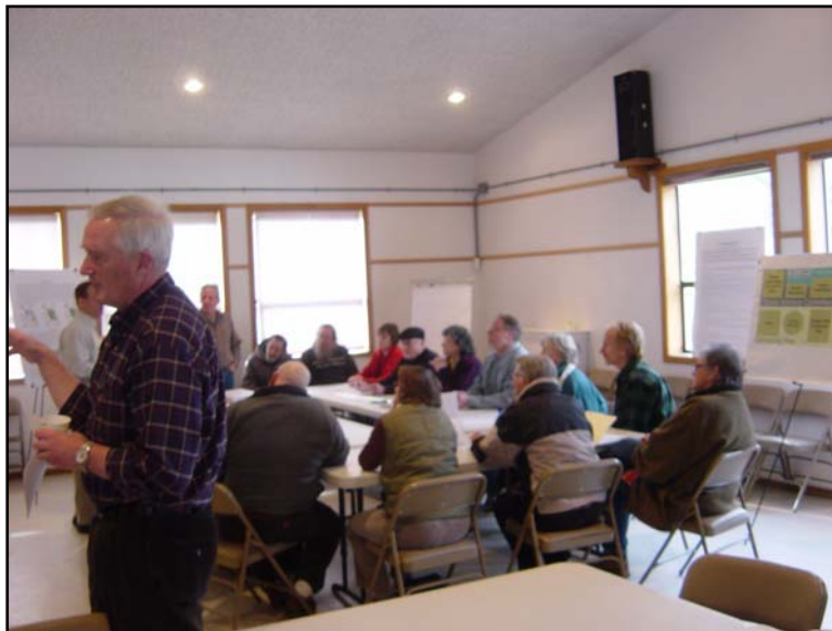
The first of three open houses at the Greater Hansville Community Center, January 24, 2009. Attendees identified issues related to the plan’s seven policy areas.

The process would build on the first three Futures phases, but also evaluate Futures assumptions and make adjustments based on new public participation, existing County policies, and GMA requirements. As part of the Greater Hansville Community Planning process, DCD staff facilitated the first formal Planning Committee meeting on March 18, 2008. Meetings and workshops occurred monthly through the summer of 2009, including two open houses, a new community survey, and public hearings.