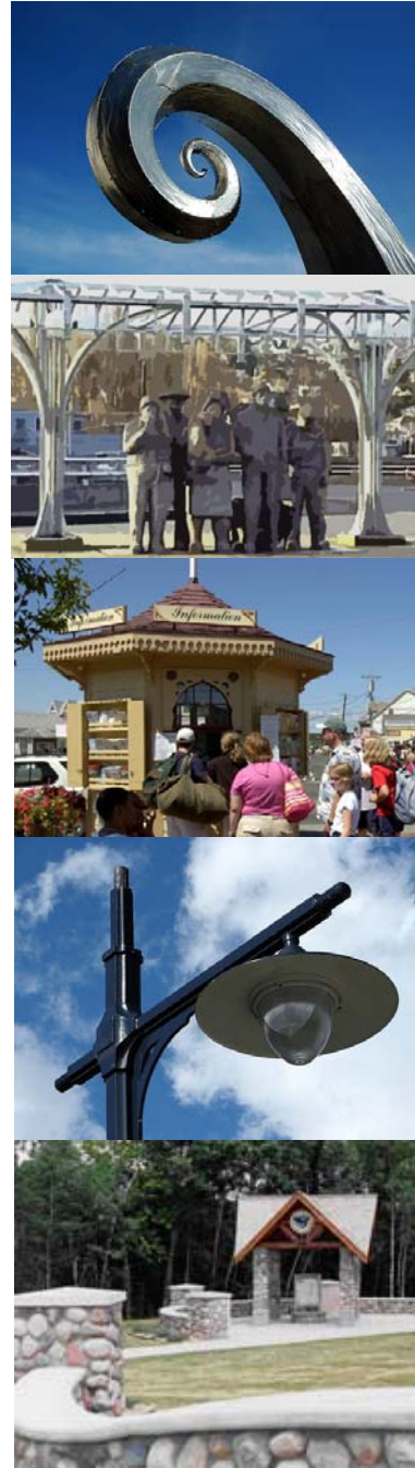
Figure 7.4.1 Possible examples of Keyport public art projects

Local non-profit groups, agencies, and organizations such as the Pomegranate Center, Washington's Artist Trust Organization, the Kitsap County Arts Board, the Washington State Department of Community, Trade, and Economic Development and other organizations could all be instrumental in assisting the Keyport Improvement Group, Port of Keyport, and the Keyport community in pursuing art and culture opportunities.