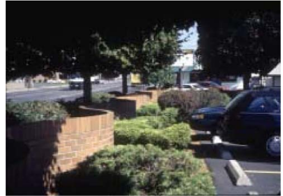
Low wall and landscaping