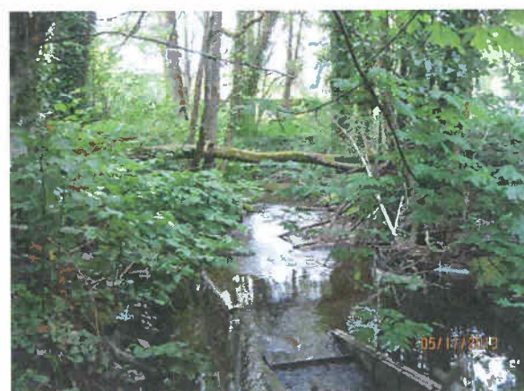
Potential Floodplain Area Downstream of Culvert/Fish-Way