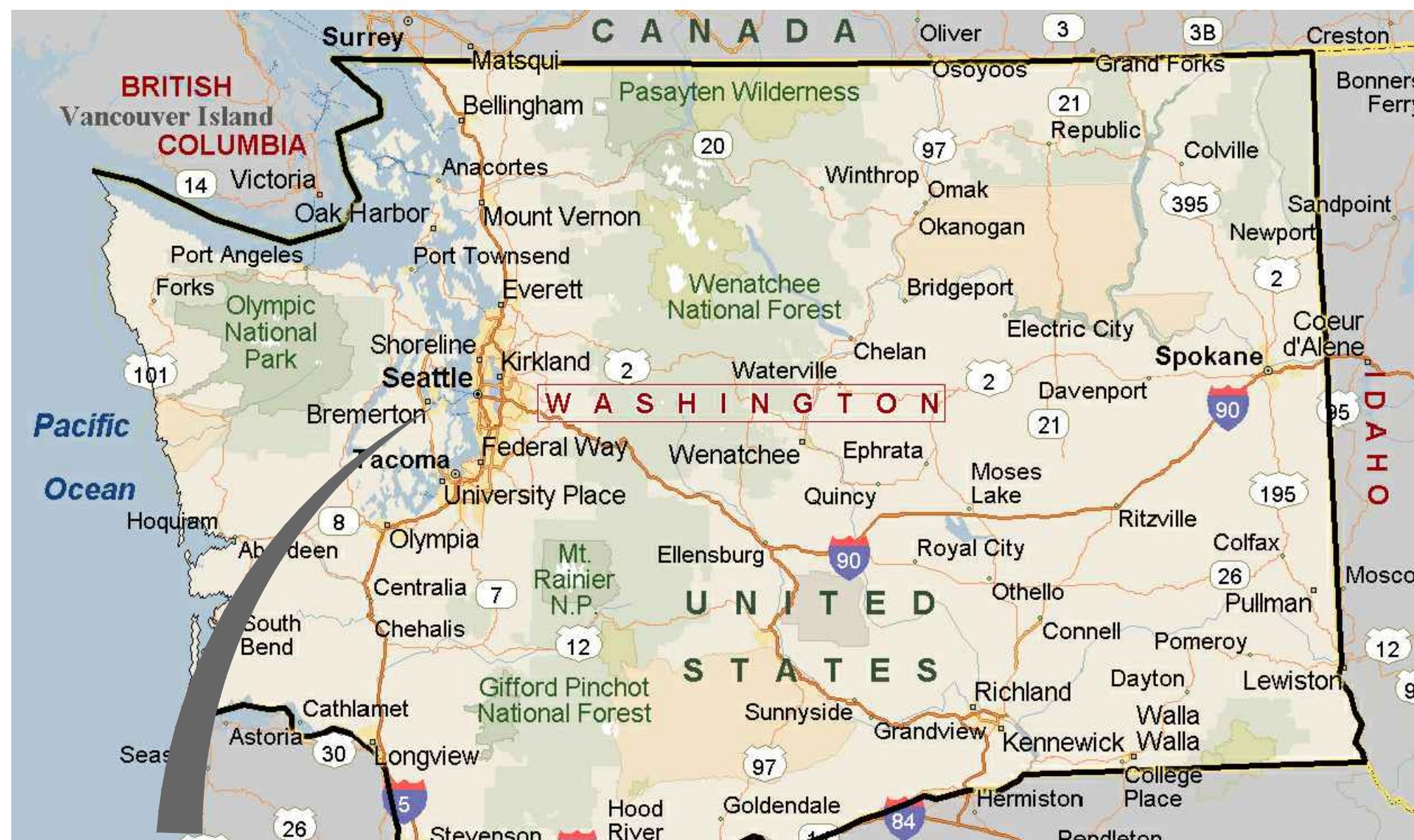
LOCATION MAP NTS