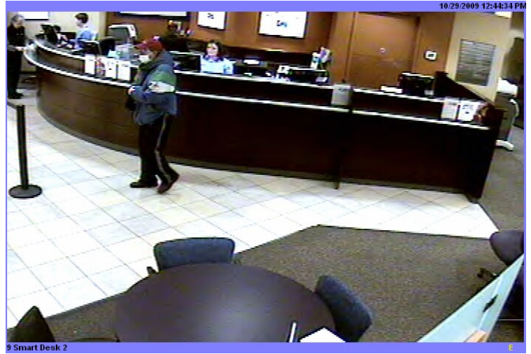
Four security camera photographs taken of a male robbery suspect at the Chase Bank branch, located inside the Fred Meyer Store, 5050 State Highway 303 NE, East Bremerton, during the early afternoon of Thursday, Oct. 29.