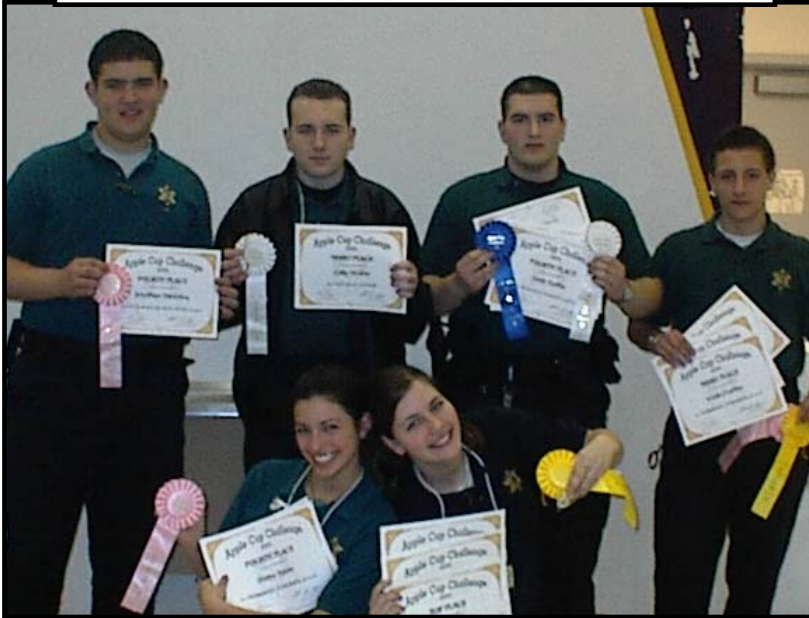
Cadets show their awards from the Apple Cup Challenge in Wenatchee

Cadets attended two Explorer Academies sponsored by the Washington Law Enforcement Explorer Advisor's Association. Each academy is one week long and held at the Army's Yakima Training Center or Camp Murray, Fort Lewis. One is held during the month of August and the other in December. The Cadets also assisted throughout the year as actors in mock scenes