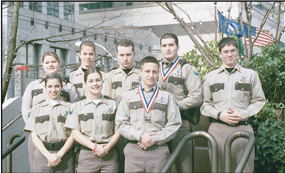
Cadets pose for a group photo while attending the Western Regional Exploring Conference in Seattle

Cadets attended and competed in the 2003 Western Regional Explorer's conference in Seattle, the Apple Cup Challenge in Wenatchee and the Capital City Shoot in Olympia. During those competitions, our Cadets performed at the highest level and received a number of awards. They also returned with a greater knowledge of police functions and operations.