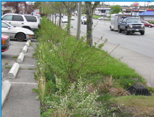
Right-of-Way Rain Garden, Poplars, Silverdale