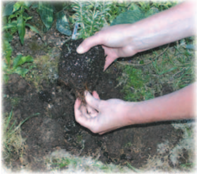
Dig a hole twice as wide and deep as the rootball. Spread the roots before planting.

Spread out the roots, add water, and tamp soil back in for good root contact. Set plants so the soil level on the stem is at the same height as at the nursery to prevent problems. Mulch new plantings well and be sure to water even drought tolerant plants during their first few summers, until they build deep roots.