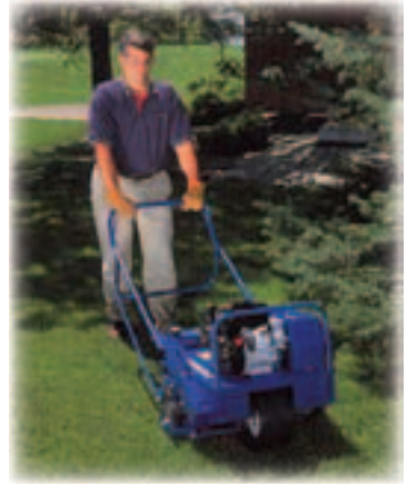
You can rent an aerator or get a yard service to aerate for you.