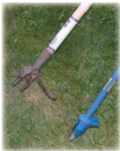
Long handled weed pullers pop dandelions out easily.