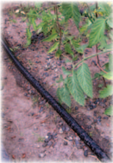
Soaker hoses save water! Cover them with mulch to save even more

Most plants do best if the soil is allowed to partially dry out between waterings. For lawns, a loss of shine or footprints showing indicate it's time to water. Vegetables and other annuals should be watered at the first sign of wilting, but tougher perennials (plants that live several years) only need water if they stay droopy after it cools off in the evening. Trees and shrubs usually don't need any watering once their roots are fully established (2 to 5 years) except in very dry years.