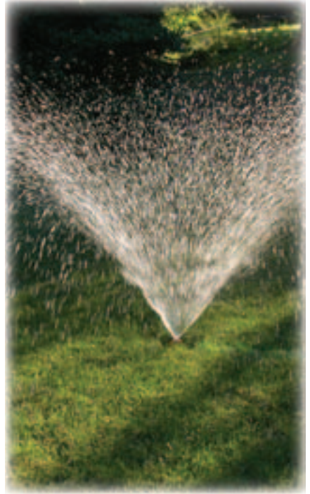
Water in the early morning or evening to reduce evaporation.