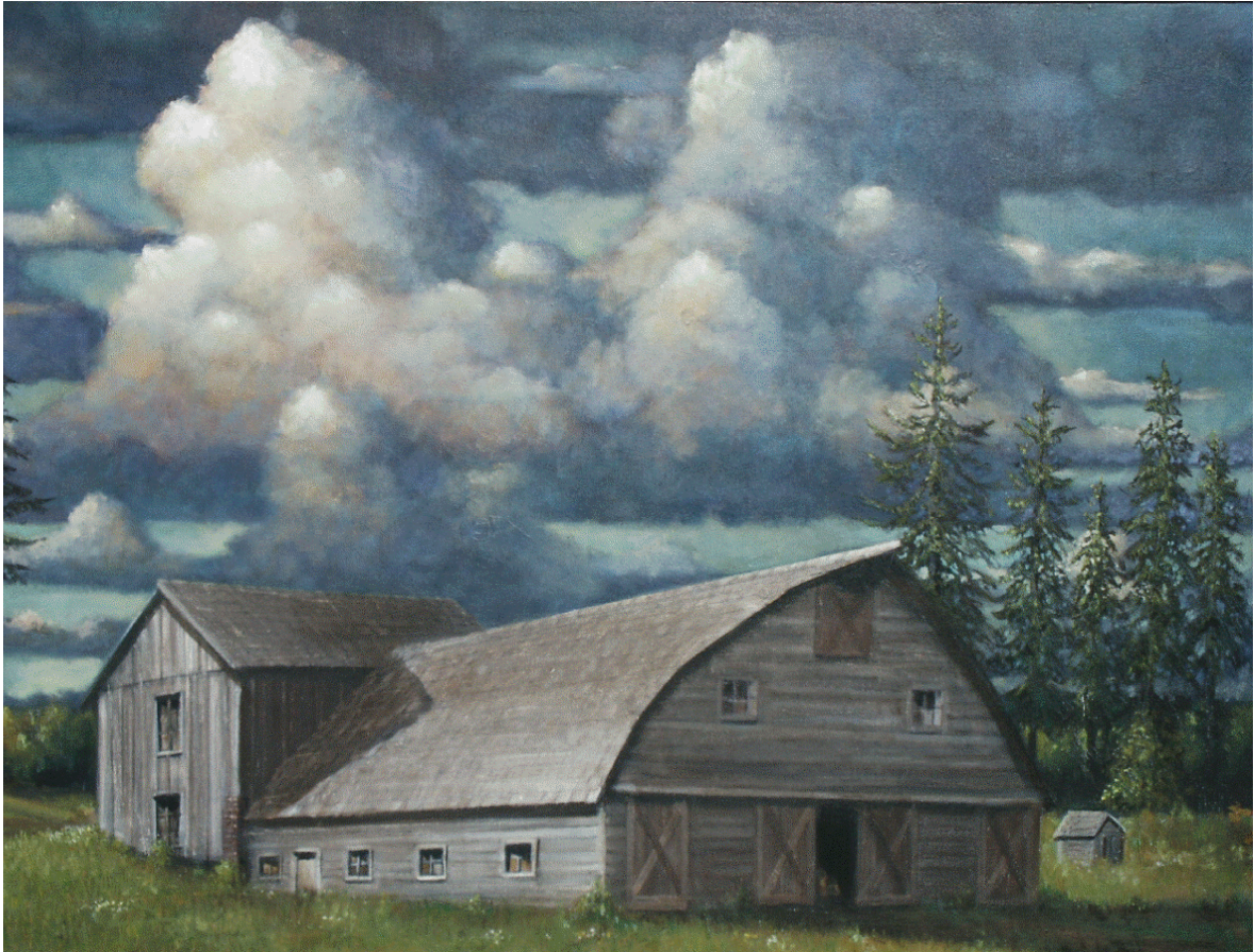
Howe Farm Painting