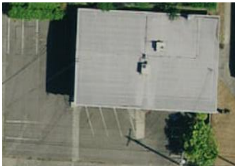
Log Church/Storage: 717 Sidney Ave Port Orchard, WA 98366