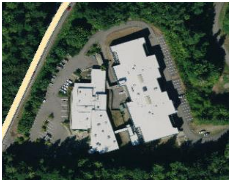
Kitsap Special Assault Unit (SAU): 715 Sidney Ave Port Orchard, WA 98366