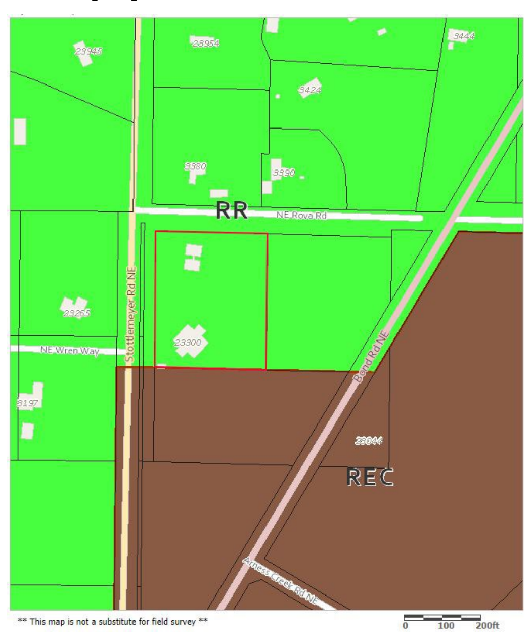
Attachment A: Zoning Designation