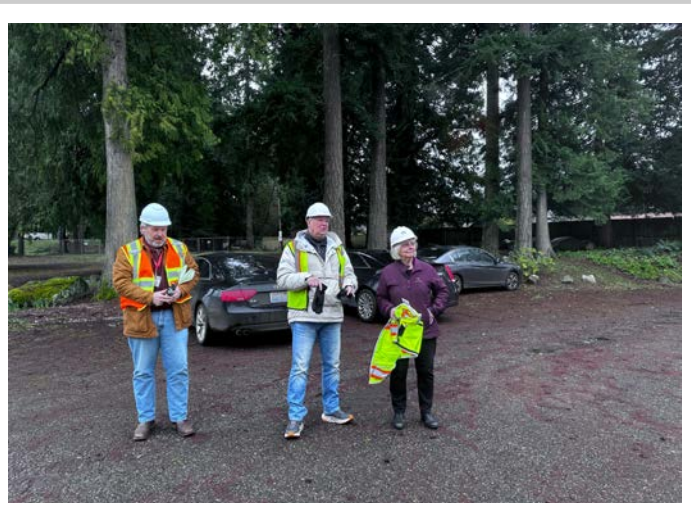
Kitsap County Project Executive Team Site Review