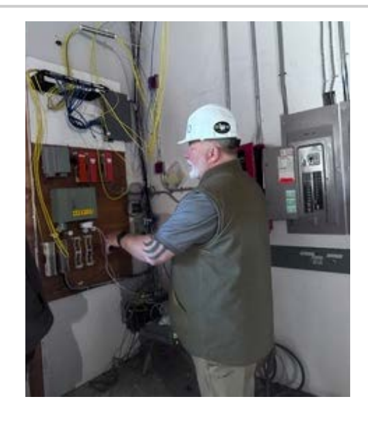
Kitsap IT / IS System upgrades