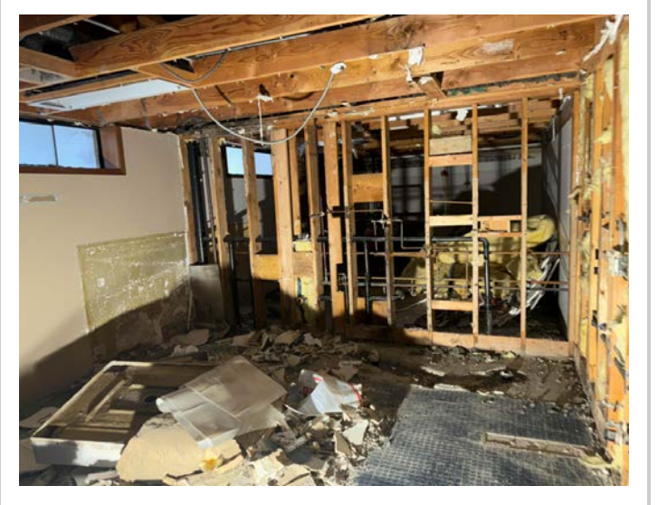
Future Shower Facilities