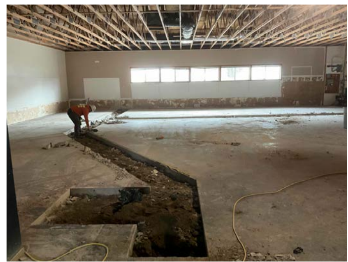
Future co-shelter living area