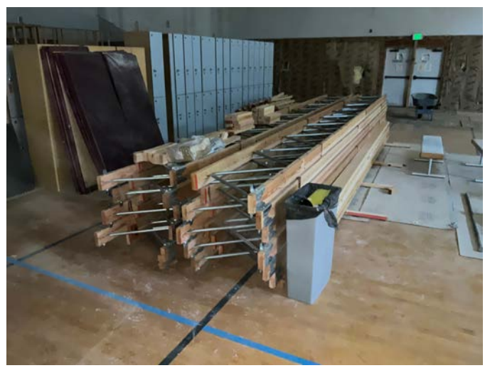
Kitchen Truss's - Arrived Onsite