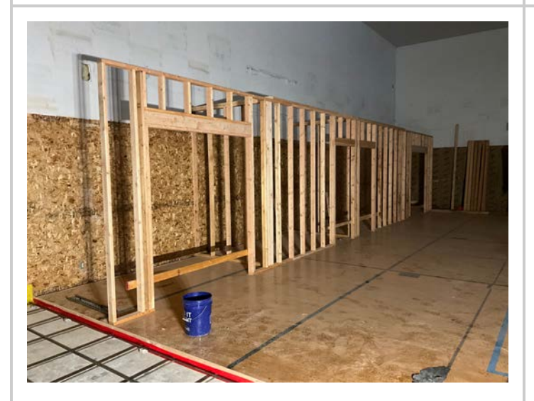
Interior Framing begins for Storage Rooms by the Lounge