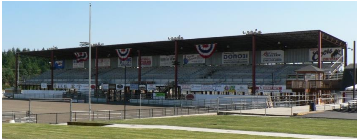
Thunderbird Stadium – D-Derby Set Up