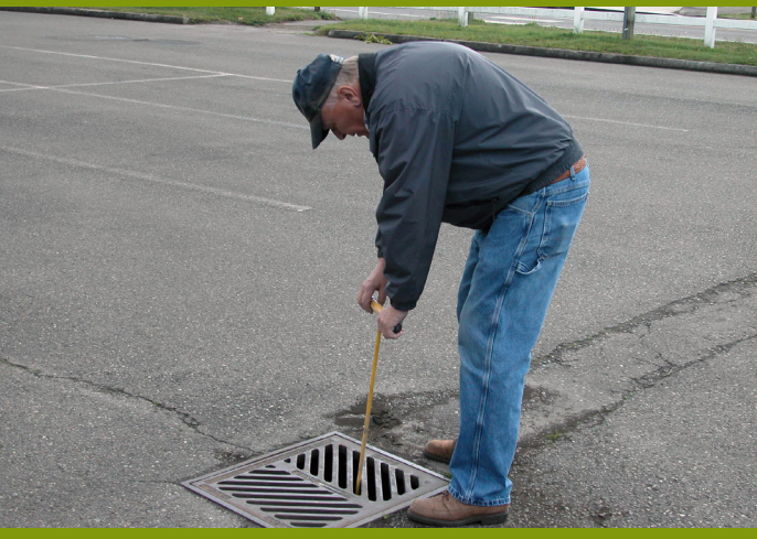
Regular inspections reduce flooding and water pollution

Regularly maintained stormwater systems reduce flooding and water pollution. Inspect and maintain facilities at least yearly and clean debris, sediment, and vegetation as needed, especially after major storms.