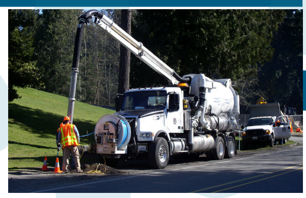
Contact a maintenance provider to clean catch basins when half full of sediment