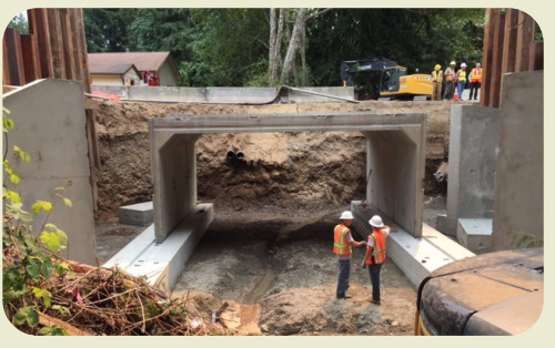
Building stormwater infrastructure

The stormwater utility fee pays for a variety of services and projects that reduce the impacts of flooding and water pollution, such as stormwater parks, floodplain restoration projects and regional stormwater treatment facilities. Daily activities such as washing cars, driving, fertilizing lawns/ gardens, and leaving pet waste on the ground contribute to water pollution. Kitsap County's stormwater systems and flood control measures reduce these impacts. All residents benefit from flood protection and clean water.