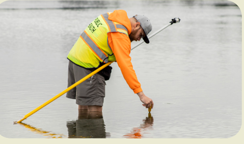
Monitoring water quality