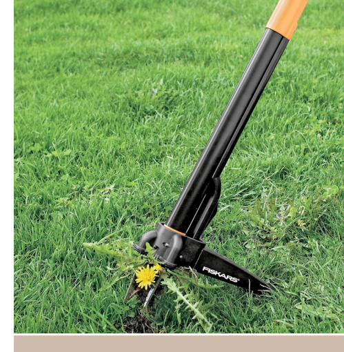
Long handled weed pullers pop dandelions out easily.

If a plant, even a tree, has pest or disease problems every year, it's time to replace it with a more tolerant variety or another type of plant that doesn't have these problems.