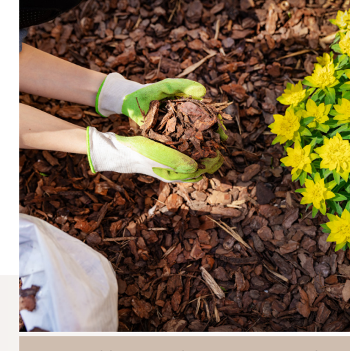
Mulch stops weeds, conserves water, and builds healthy soil for healthier plants. Spread mulch several inches deep and 1inch away from plant stems.

Lawns: Mulch your lawn? Yes, you can grasscycle (leave the clippings) and spread compost on lawns—see Step 5