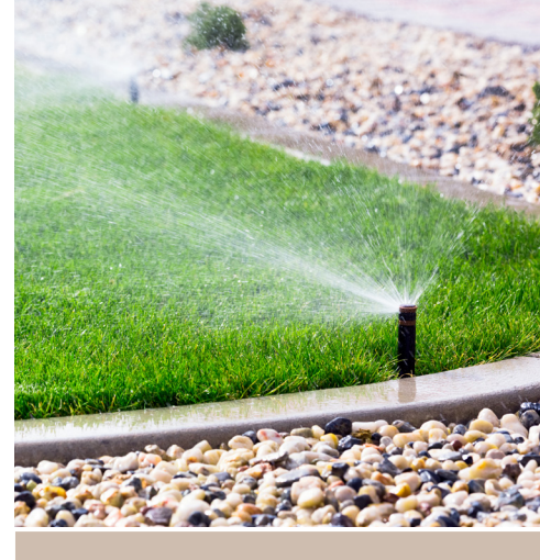
Water in the early morning or evening to reduce evaporation.

Automatic systems can actually either waste water or be fairly efficient, depending on how you set and maintain them.