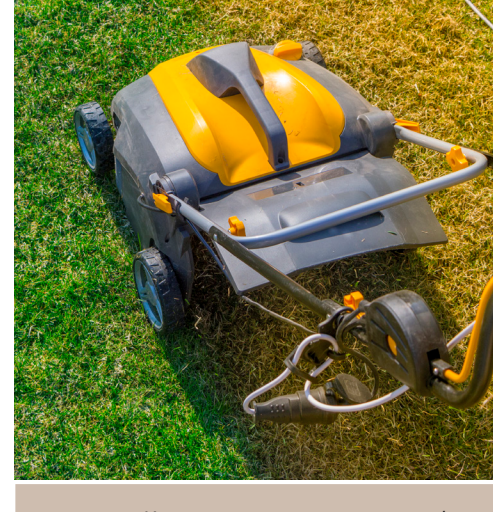
You can rent an aerator or get a yard service to aerate for you.