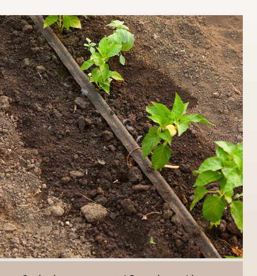
Soaker hoses save water! Cover them with mulch to save even more.

Watering deeply builds deeper, healthier root systems. To see if you are watering deep enough to moisten the whole root zone, dig in with a trowel an hour after watering to check the depth.