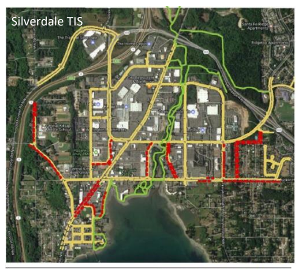
Figure 6. Gaps in the Existing Sidewalk Network