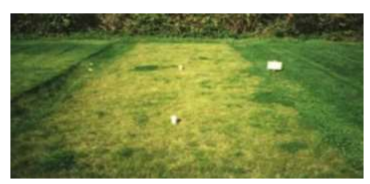
University of Washington Test Plot. Mineral soil with no amendment. High in runoff. Poor turf quality.

Kitsap County Department of Community Development 614 Division Street, MS-36 Port Orchard, WA 98366-4682 www.kitsapgov.com/dcd