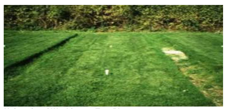
University of Washington Test Plot. Mineral soil with 30 percent compost amendment. Up to 50 percent less runoff. Turf still healthy after 4 years.