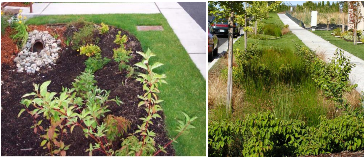
Figure 2 Rain gardens can be constructed in a variety of shapes and have diverse planting schemes.