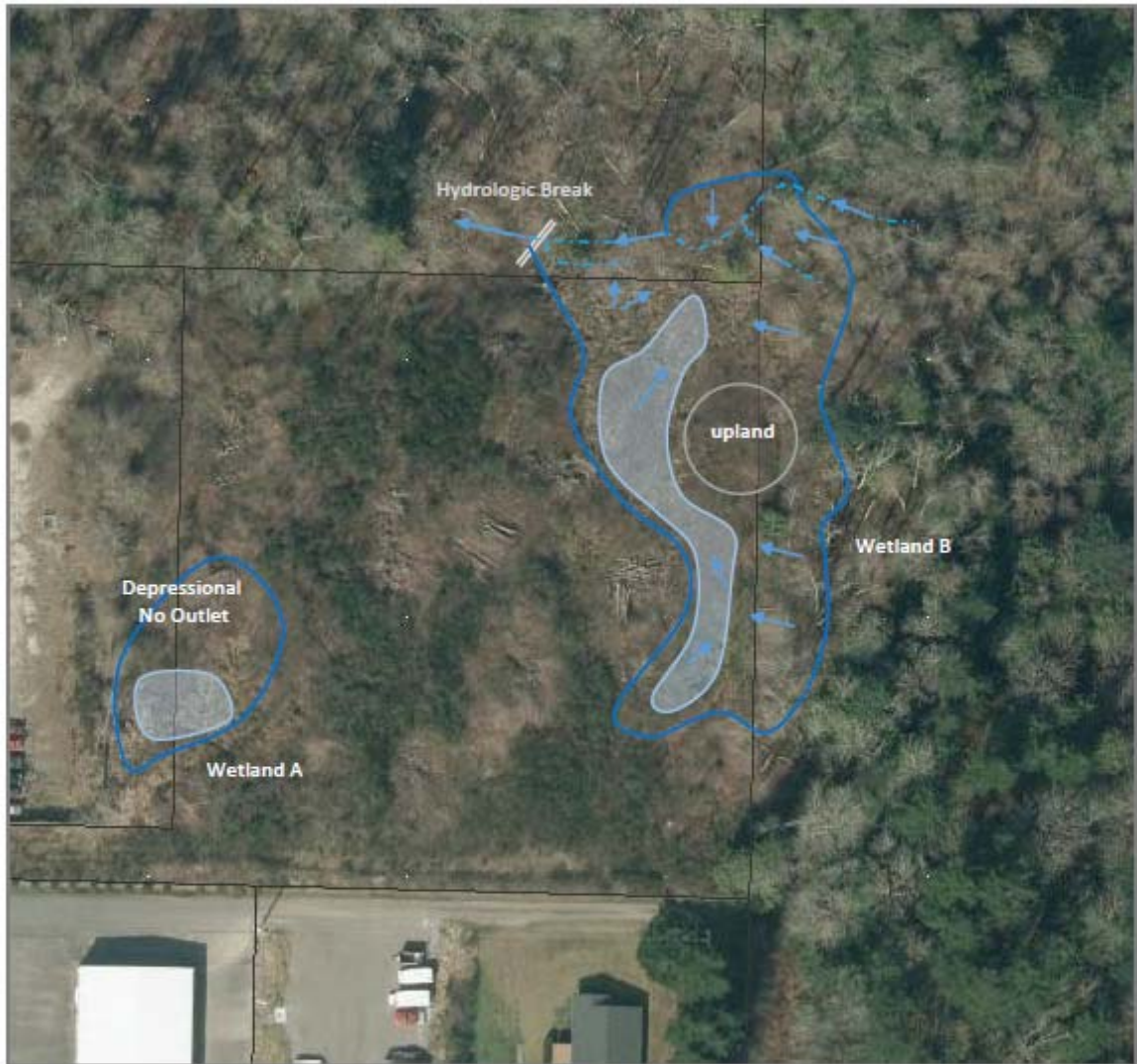
Figure 2. Hydroperiods Wetland A and Wetland Unit B Seasonal inundation (shaded)

ALL SECURE SELF STORAGE 6000 Block State Highway 303 NE Bremerton WA