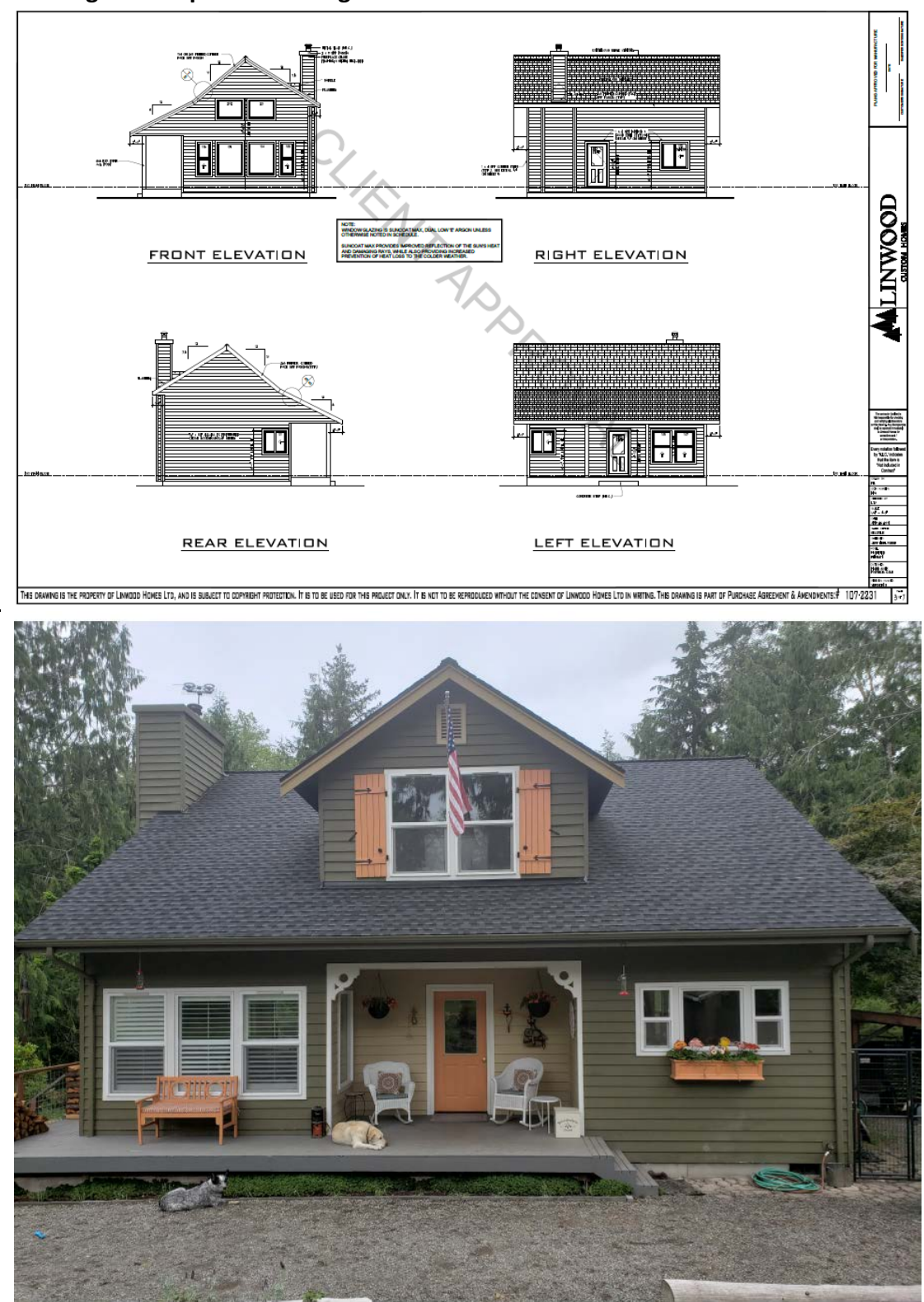
Existing and Proposed Building Elevations