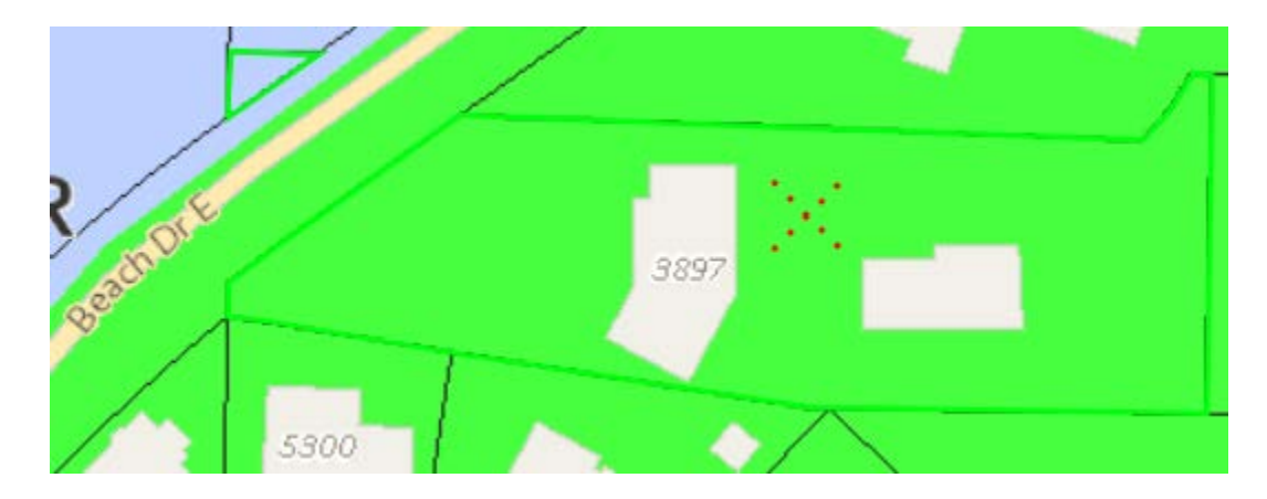
Attachment B – Zoning Map