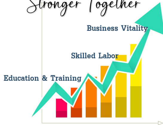
Reports & Data - Association of Washington Business (awb.org)

Is your business experiencing difficulty finding enough workers?