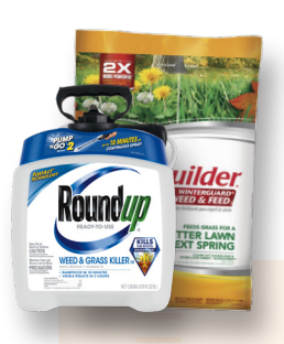
Pesticides and Herbicides

Dry small amounts of latex and put in garbage.